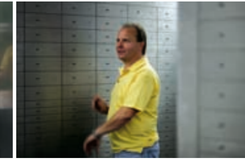
The daily routine for the Facility Manager mainly includes checks on the building’s infrastructure – a task that requires varied technical knowledge and an acute sense of the needs of the building’s users.